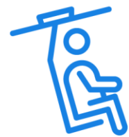
Accelerate the journey to the cloud