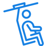
Accelerate the journey to the cloud