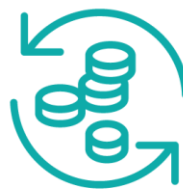
Keep costs under control