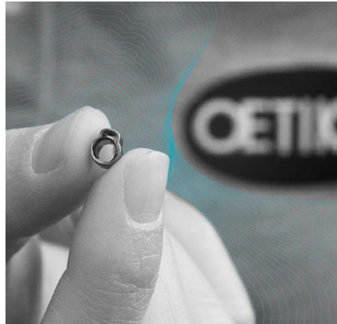
In analysis processes, the increase in efficiency thanks to SAP S/4HANA is striking.

Oetiker is now in the innovation phase. ‘We are currently exploring which innovations can be tackled in which line of business – depending on the need and speed.’ Artificial intelligence or robotic automation in the machine parks are topics. ‘Our focus is on optimizing transparency in the supply chain. An initial test phase of the predictive delivery functionality went well and we received very good feedback from our users.’ Intuitive user interfaces ensure that such new functionalities will quickly establish themselves on a broad scale in the future.